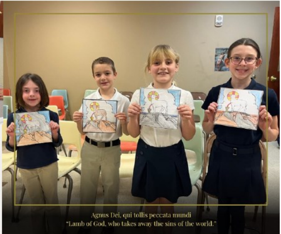
Agnus Dei, qui tollis peccata mundi "Lamb of God, who takes away the sins of the world."