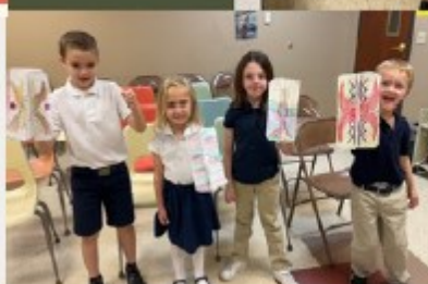
Miles Christi sum "I am a soldier of Christ."

"Therefore take up the whole armor of God, that you may be able to withstand in the evil day, and having done all, to stand firm. Stand therefore, having fastened on the belt of truth, and having put on the breastplate of righteousness, and, as shoes for your feet, having put on the readiness given by the gospel of peace. In all circumstances take up the shield of faith, with which you can extinguish all the flaming darts of the evil one; and take the helmet of salvation, and the sword of the Spirit, which is the word of God, praying at all times in the Spirit, with all prayer and supplication." Ephesians 6:13-18