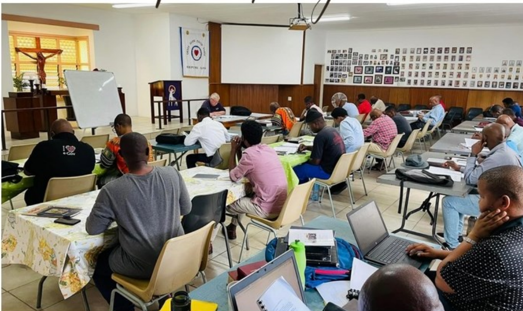
Lutheran Theological Seminary in Pretoria, South Africa